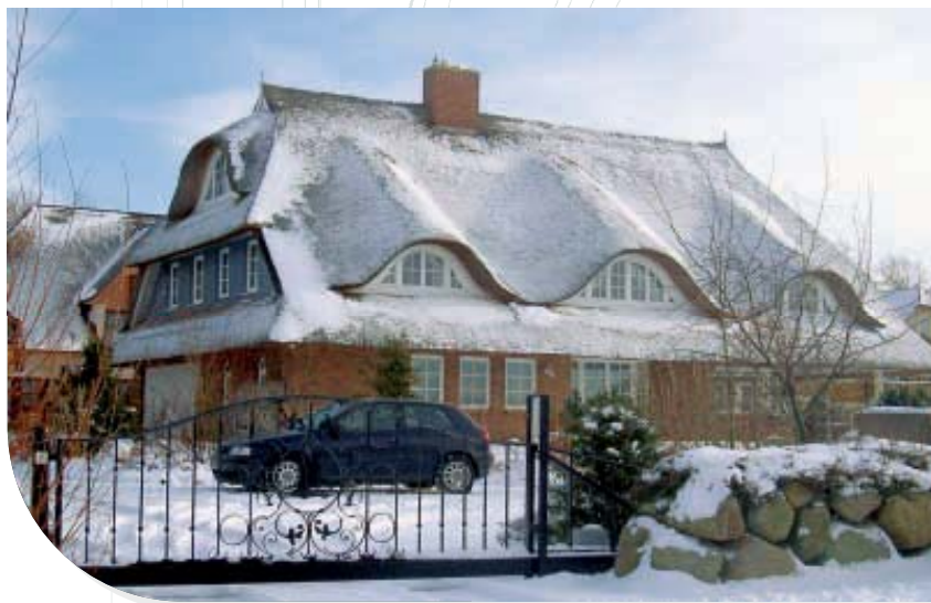
YEAR OF COMPLETION: 1998

THE BUILDING SHELL FOR THIS LUXURIOUS FAMILY HOME IN WUSTROW (GERMANY) WAS ERECTED USING VS-SYSTEM ELEMENTS AS WELL AS HAND-SHAPED CLINKER BRICKWORK FOR THE EXTERNAL WALLS. THE HOUSE IS IDYLICLY SITUATED AT THE BALTIC SEA RESORT OF WUSTROW AND HAS A THATCHED ROOF WHICH IS TYPICAL FOR THIS REGION.