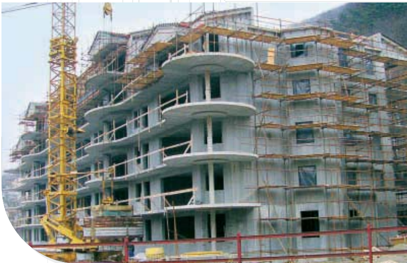
CONSTRUCTION SITE KRISTOFF PLAZA APARTMENTS, TRENČIANSKE TEPLICE

VPG VERBUNDSYSTEME PLANUNGS-PRODUKTIONS-BAUGESELLSCHAFT MBH