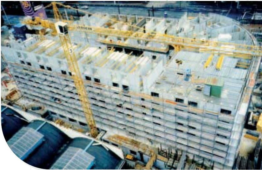
CONSTRUCTION SITE DORINT HOTEL AN DER MESSE KÖLN-DEUTZ